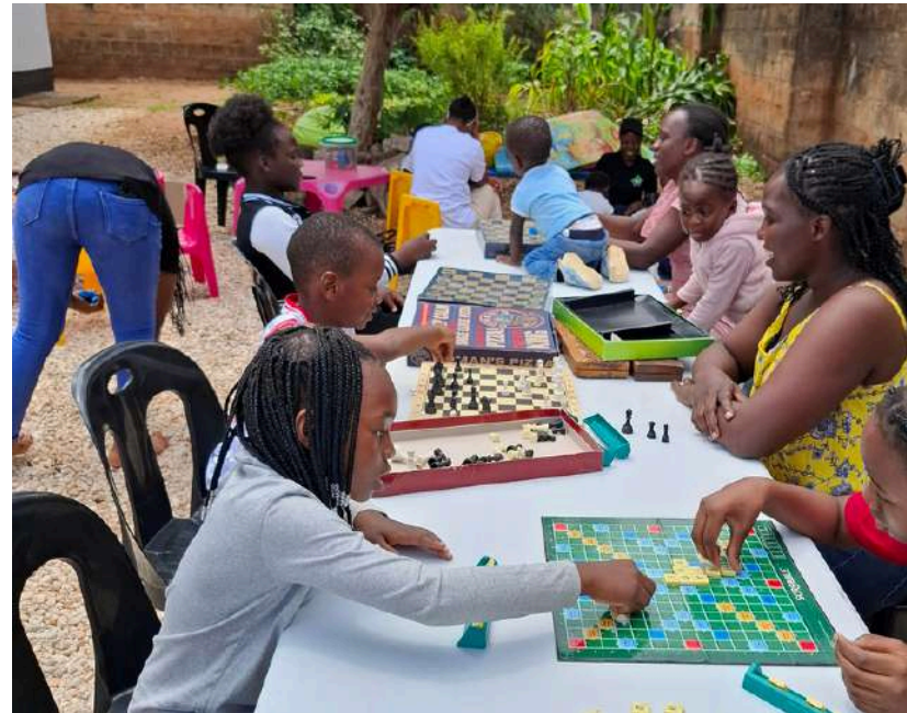
Parents Vs Children fundraising event

To donate please email us at: info@natubelibrary.org or donate here