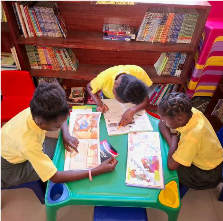
Free reading session