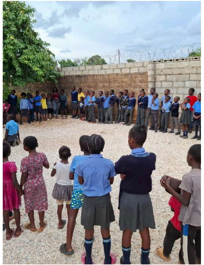
Learning through play activity