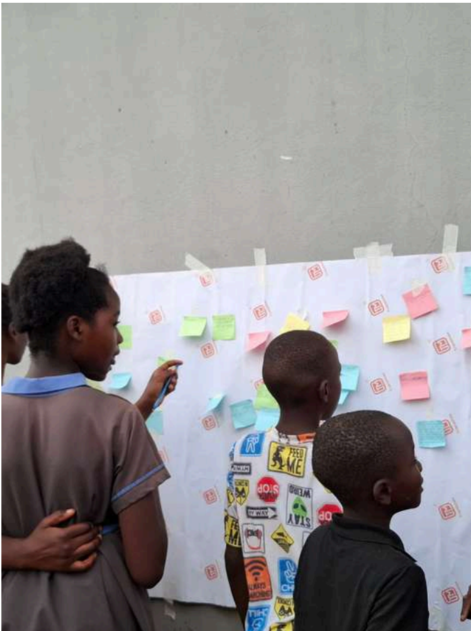
Mental Health session