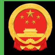
Chinese Embassy in Zambia